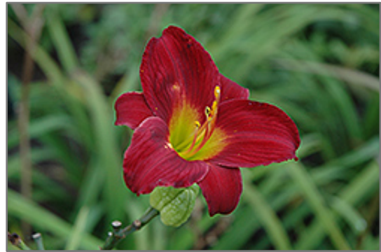
Stella In Red Daylily flowers