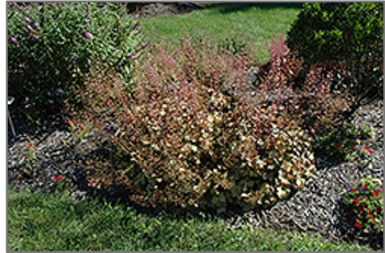
Pinot Gris Coral Bells in bloom