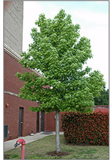
Happidaze Sweet Gum

This tree should only be grown in full sunlight. It prefers to grow in average to moist conditions, and shouldn't be allowed to dry out. It is very fussy about its soil conditions and must have rich, acidic soils to ensure success, and is subject to chlorosis (yellowing) of the foliage in alkaline soils. It is somewhat tolerant of urban pollution. This is a selection of a native North American species.