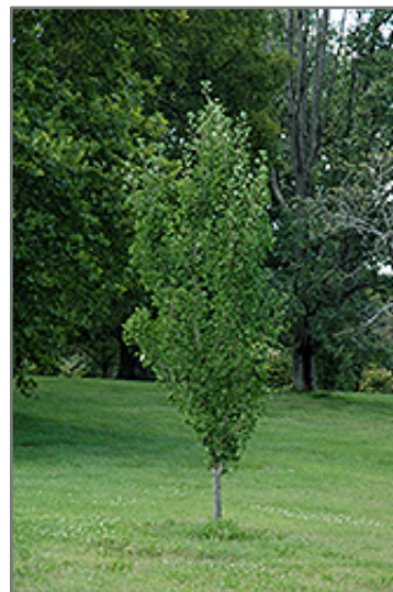
Presidential Gold Ginkgo