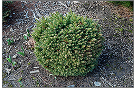
Witches Brood Norway Spruce