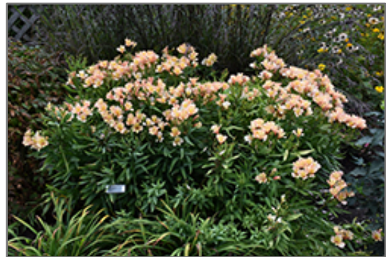
Inca Ice Alstroemeria in bloom