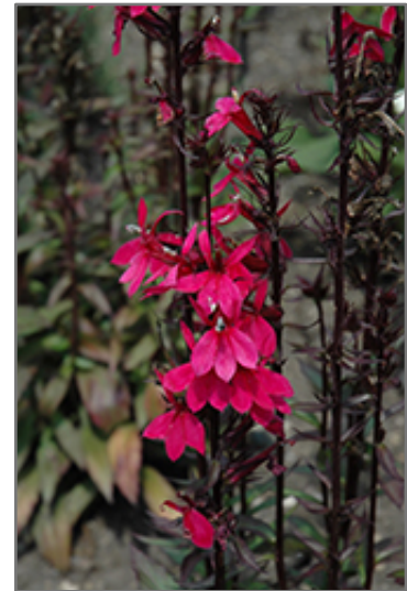
Starship Deep Rose Lobelia flowers

Starship Deep Rose Lobelia is recommended for the following landscape applications;