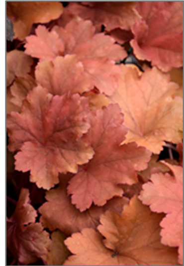
Rio Coral Bells foliage

Rio Coral Bells is recommended for the following landscape applications;