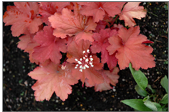
Rio Coral Bells flowers