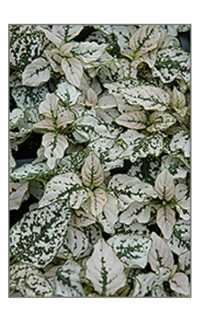
Splash Select White Polka Dot Plant foliage

When grown indoors, Splash Select White Polka Dot Plant can be expected to grow to be about 12 inches tall at maturity, with a spread of 12 inches. It grows at a fast rate, and under ideal conditions can be expected to live for approximately 5 years. This houseplant will do well in a location that gets either direct or indirect sunlight, although it will usually require a more brightly-lit environment than what artificial indoor lighting alone can provide. It does best in average to evenly moist soil, but will not tolerate standing water. The surface of the soil shouldn't be allowed to dry out completely, and so you should expect to water this plant once and possibly even twice each week. Be aware that your particular watering schedule may vary depending on its location in the room, the pot size, plant size and other conditions; if in doubt, ask one of our experts in the store for advice. It is not particular as to soil type or pH; an average potting soil should work just fine.