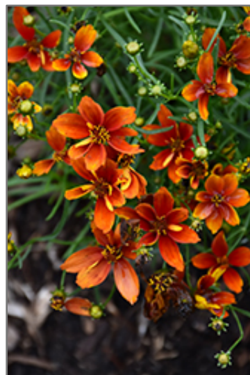
Sizzle And Spice Crazy Cayenne Tickseed flowers

Sizzle And Spice Crazy Cayenne Tickseed is recommended for the following landscape applications;