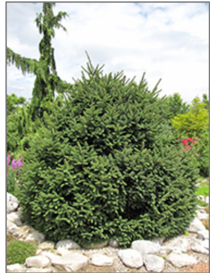
Clanbrassiliana Stricta Norway Spruce