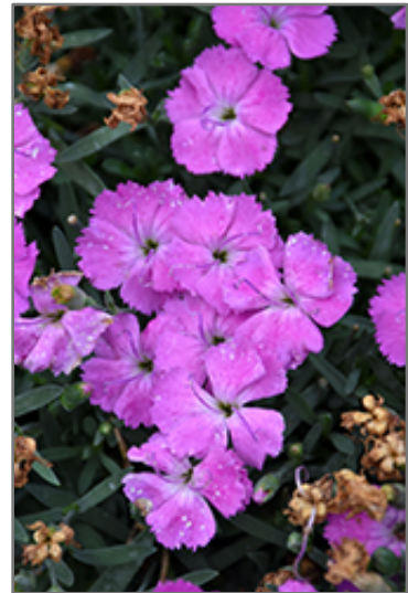
Paint The Town Fuchsia Pinks flowers

This is a relatively low maintenance plant, and is best cleaned up in early spring before it resumes active growth for the season. It is a good choice for attracting bees and butterflies to your yard, but is not particularly attractive to deer who tend to leave it alone in favor of tastier treats. It has no significant negative characteristics.