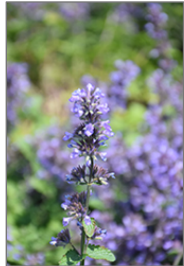
Cat's Pajamas Catmint flowers

Cat's Pajamas Catmint is recommended for the following landscape applications;