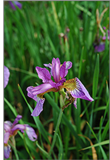
Dream Spires Siberian Iris flowers

Dream Spires Siberian Iris will grow to be about 24 inches tall at maturity extending to 3 feet tall with the flowers, with a spread of 24 inches. When grown in masses or used as a bedding plant, individual plants should be spaced approximately 18 inches apart. It grows at a medium rate, and under ideal conditions can be expected to live for approximately 10 years. As an herbaceous perennial, this plant will usually die back to the crown each winter, and will regrow from the base each spring. Be careful not to disturb the crown in late winter when it may not be readily seen!