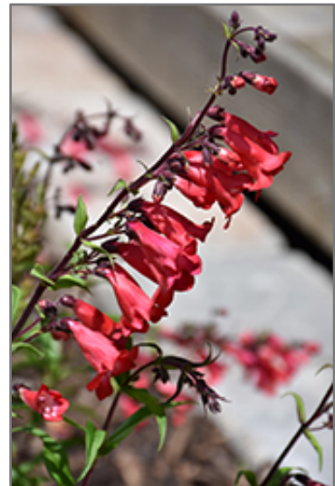
Cherry Sparks Beard Tongue flowers