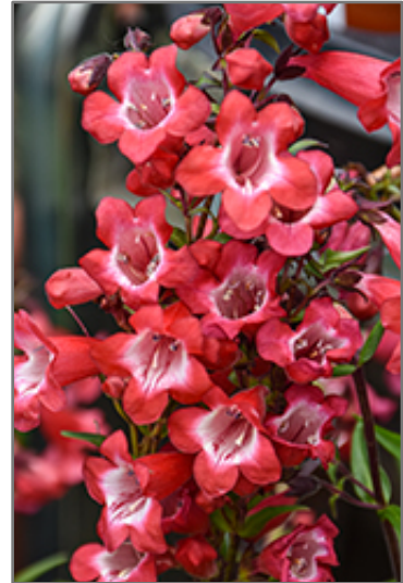
Cherry Sparks Beard Tongue flowers

Cherry Sparks Beard Tongue is recommended for the following landscape applications;