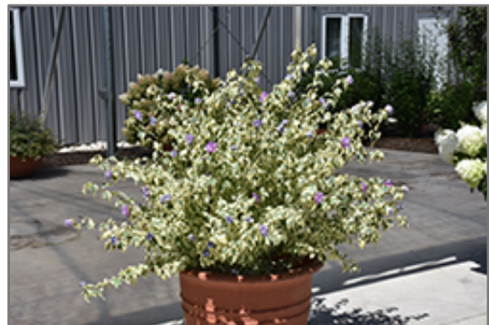
Sugar Tip Gold Rose of Sharon in bloom