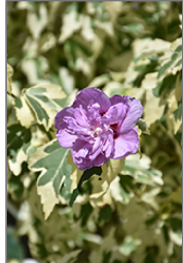
Sugar Tip Gold Rose of Sharon flowers

This is a high maintenance shrub that will require regular care and upkeep, and is best pruned in late winter once the threat of extreme cold has passed. It is a good choice for attracting butterflies and hummingbirds to your yard, but is not particularly attractive to deer who tend to leave it alone in favor of tastier treats. Gardeners should be aware of the following characteristic(s) that may warrant special consideration;