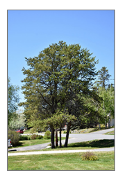
Jack Pine

Jack Pine will grow to be about 45 feet tall at maturity, with a spread of 35 feet. It has a low canopy with a typical clearance of 4 feet from the ground, and should not be planted underneath power lines. It grows at a slow rate, and under ideal conditions can be expected to live for 80 years or more.