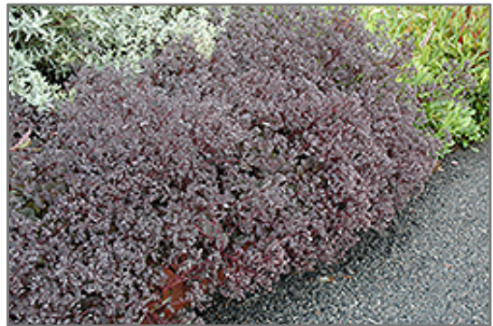
Bertram Anderson Stonecrop