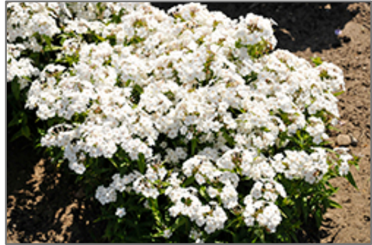
Baby Doll White Garden Phlox in bloom

Baby Doll White Garden Phlox is recommended for the following landscape applications;