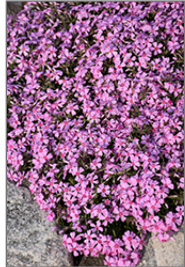
Eye Candy Creeping Phlox in bloom

Eye Candy Creeping Phlox is recommended for the following landscape applications;