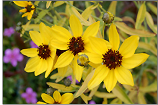
Lightning Flash Tickseed flowers

Lightning Flash Tickseed is recommended for the following landscape applications;