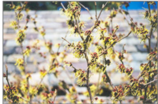
Primavera Witchhazel flowers