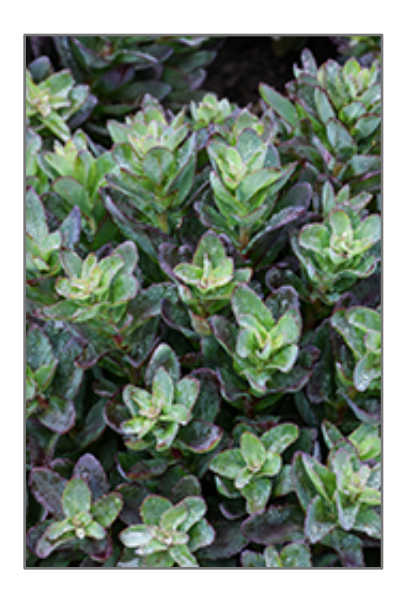
Conga Line Stonecrop foliage

This is a relatively low maintenance plant, and is best cleaned up in early spring before it resumes active growth for the season. It is a good choice for attracting bees and butterflies to your yard, but is not particularly attractive to deer who tend to leave it alone in favor of tastier treats. It has no significant negative characteristics.