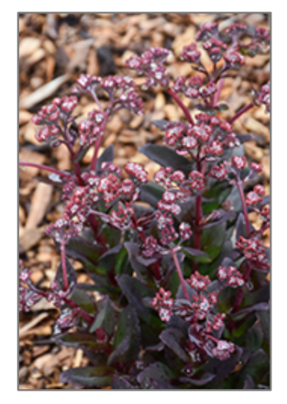
Conga Line Stonecrop flowers

CustomerCare@WestonNurseries.com 93 East Main Street Hopkinton MA 02148 - (508) 435-3414 160 Pine Hill Road Chelmsford MA 01824 - (978) 349-0055 COMMERCIAL: commsales@westonnurseries.com - (508) 293-8028