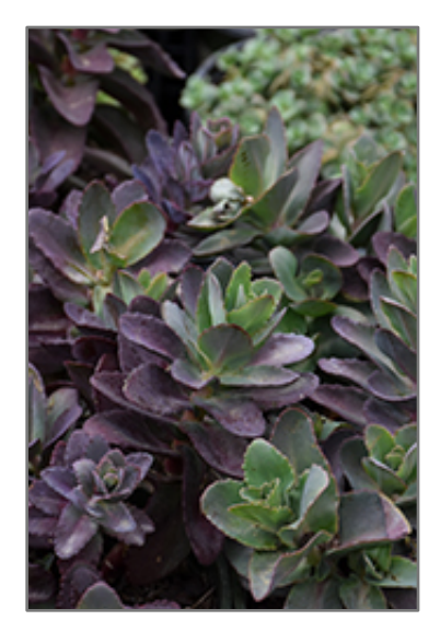
Conga Line Stonecrop foliage

CustomerCare@WestonNurseries.com 93 East Main Street Hopkinton MA 02148 - (508) 435-3414 160 Pine Hill Road Chelmsford MA 01824 - (978) 349-0055 COMMERCIAL: commsales@westonnurseries.com - (508) 293-8028