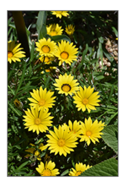
Colorado Gold Gazania flowers

Colorado Gold Gazania is recommended for the following landscape applications;