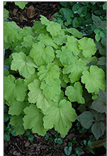
Pistache Coral Bells