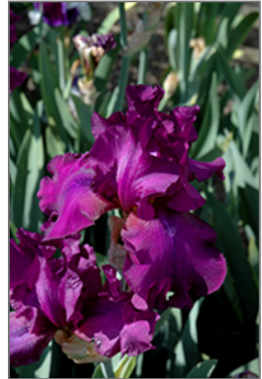
Sultry Mood Iris flowers

Sultry Mood Iris features bold purple flag-like flowers with blue falls at the ends of the stems in late spring. The flowers are excellent for cutting. Its large sword-like leaves remain green in color throughout the season.