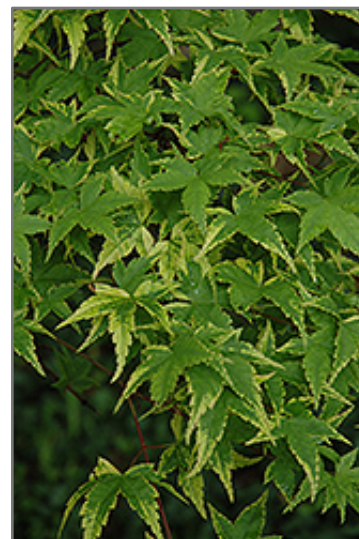
Sagara Nishiki Japanese Maple foliage