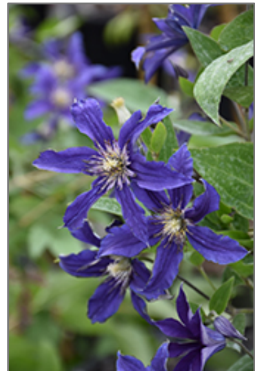
Sapphire Indigo Clematis flowers