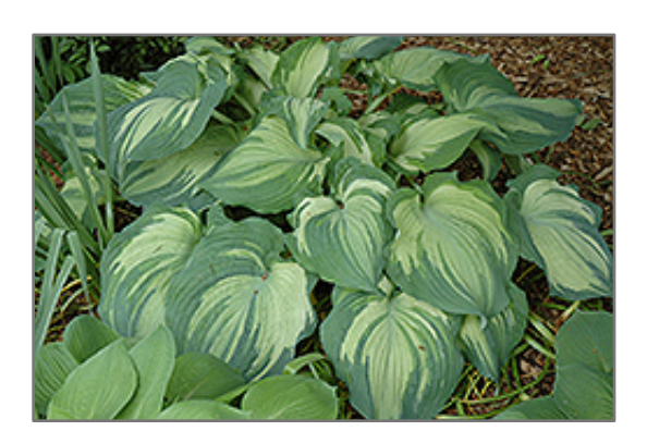
Guardian Angel Hosta