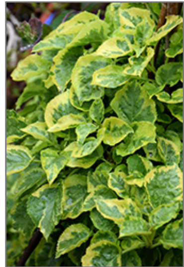
Miranda Climbing Hydrangea foliage