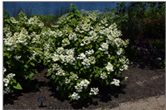
White Diamonds Hydrangea in bloom