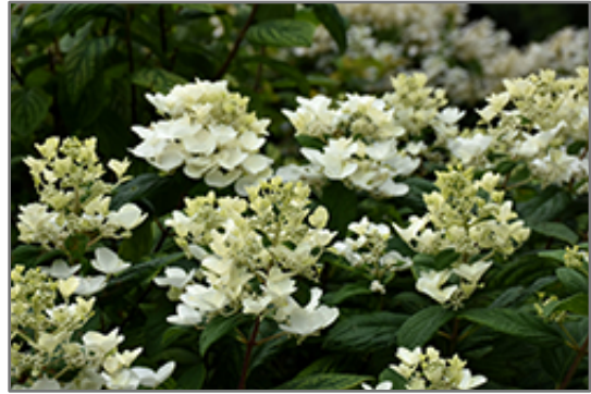
White Diamonds Hydrangea flowers

This shrub performs well in both full sun and full shade. It prefers to grow in average to moist conditions, and shouldn't be allowed to dry out. It is not particular as to soil type or pH. It is highly tolerant of urban pollution and will even thrive in inner city environments. Consider applying a thick mulch around the root zone in winter to protect it in exposed locations or colder microclimates. This is a selected variety of a species not originally from North America.