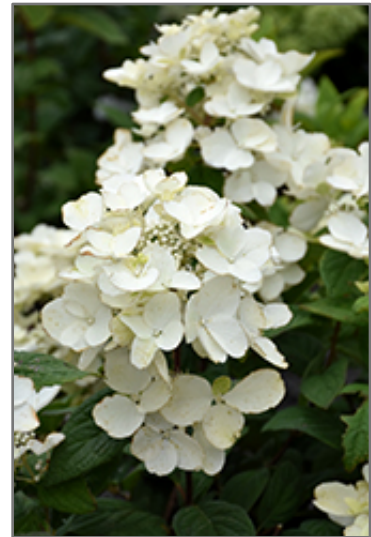
White Diamonds Hydrangea flowers