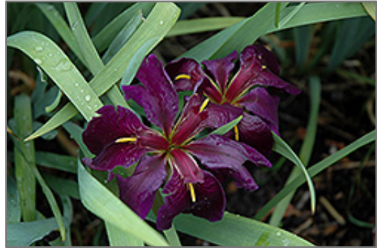
Black Gamecock Iris flowers