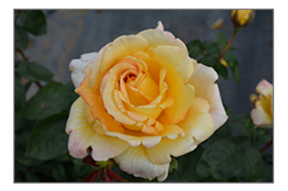
Oregold Rose flowers

Oregold Rose is a multi-stemmed deciduous shrub with an upright spreading habit of growth. Its average texture blends into the landscape, but can be balanced by one or two finer or coarser trees or shrubs for an effective composition.