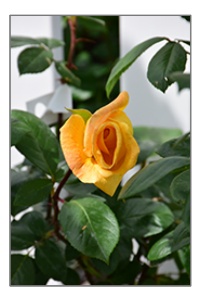
Oregold Rose flower buds

This shrub will require occasional maintenance and upkeep, and is best pruned in late winter once the threat of extreme cold has passed. It is a good choice for attracting bees to your yard. Gardeners should be aware of the following characteristic(s) that may warrant special consideration;