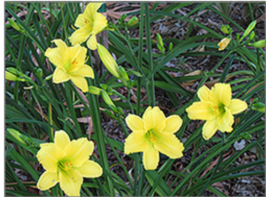
Green Flutter Daylily flowers