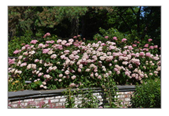
Invincibelle Spirit Smooth Hydrangea in bloom