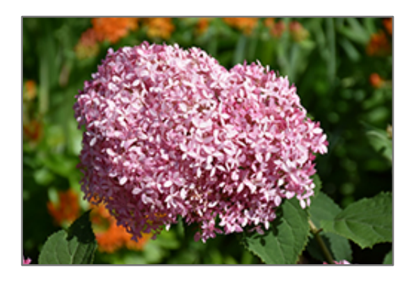
Invincibelle Spirit Smooth Hydrangea flowers