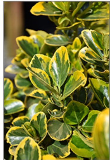
Gold Variegated Japanese Euonymus foliage