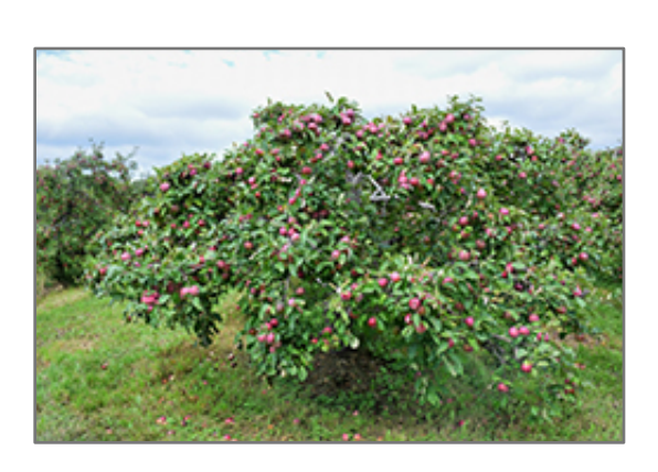
Macintosh Apple fruit

This tree is typically grown in a designated area of the yard because of its mature size and spread. It should only be grown in full sunlight. It prefers to grow in average to moist conditions, and shouldn't be allowed to dry out. It is not particular as to soil type or pH. It is highly tolerant of urban pollution and will even thrive in inner city environments. This particular variety is an interspecific hybrid.