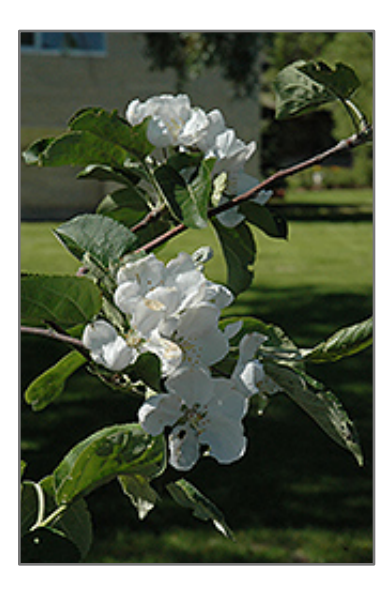
Macintosh Apple flowers