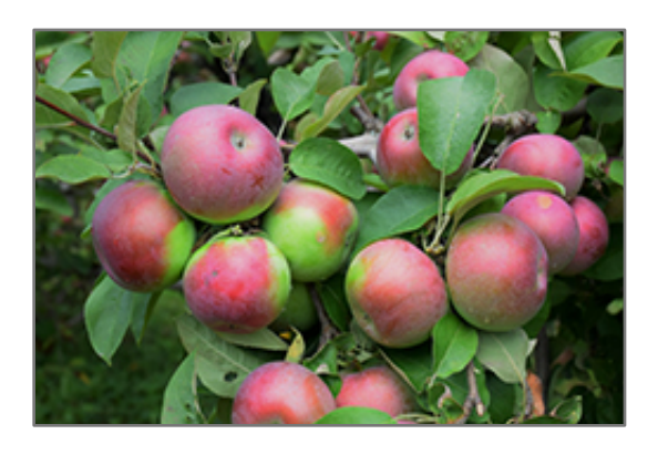
Macintosh Apple fruit

Macintosh Apple features showy clusters of lightly-scented white flowers with shell pink overtones along the branches in mid spring, which emerge from distinctive pink flower buds. It has forest green deciduous foliage. The pointy leaves turn yellow in fall. The fruits are showy red apples with hints of light green, which are carried in abundance in early fall. The fruit can be messy if allowed to drop on the lawn or walkways, and may require occasional clean-up.