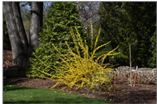
Show Off Forsythia in bloom