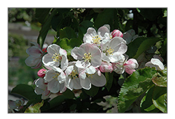
Jonagold Apple flowers