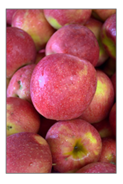
Jonagold Apple fruit

Jonagold Apple features showy clusters of lightly-scented white flowers with shell pink overtones along the branches in mid spring, which emerge from distinctive pink flower buds. It has forest green deciduous foliage. The pointy leaves turn yellow in fall. The fruits are showy yellow apples with a scarlet blush, which are carried in abundance in mid fall. The fruit can be messy if allowed to drop on the lawn or walkways, and may require occasional clean-up.