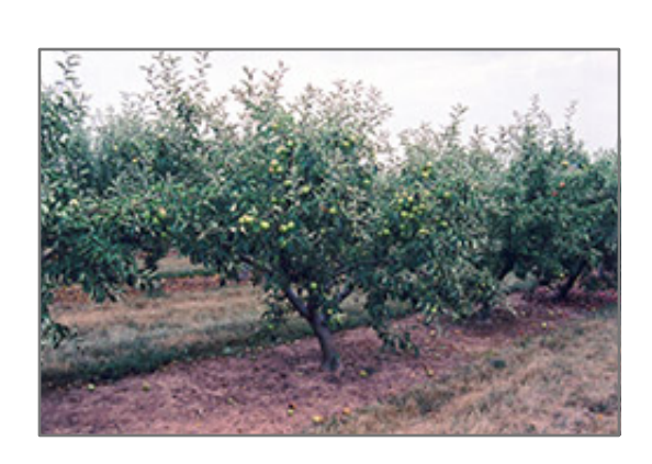
Jonagold Apple

This tree is typically grown in a designated area of the yard because of its mature size and spread. It should only be grown in full sunlight. It prefers to grow in average to moist conditions, and shouldn't be allowed to dry out. It is not particular as to soil type or pH. It is highly tolerant of urban pollution and will even thrive in inner city environments. This particular variety is an interspecific hybrid.