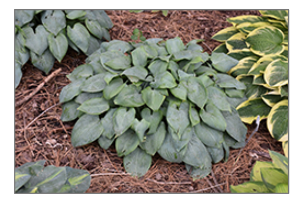
Fragrant Blue Hosta