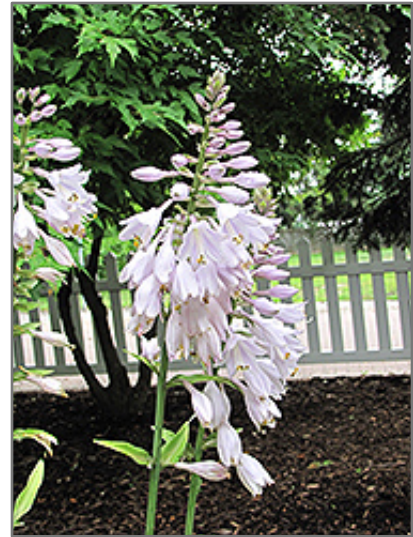
Key West Hosta flowers