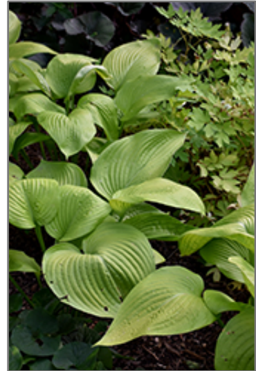
Key West Hosta

This plant does best in partial shade to shade. It prefers to grow in average to moist conditions, and shouldn't be allowed to dry out. It is not particular as to soil type or pH. It is somewhat tolerant of urban pollution. This particular variety is an interspecific hybrid. It can be propagated by division; however, as a cultivated variety, be aware that it may be subject to certain restrictions or prohibitions on propagation.