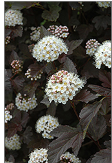
Diablo Ninebark flowers

Diablo Ninebark is recommended for the following landscape applications;