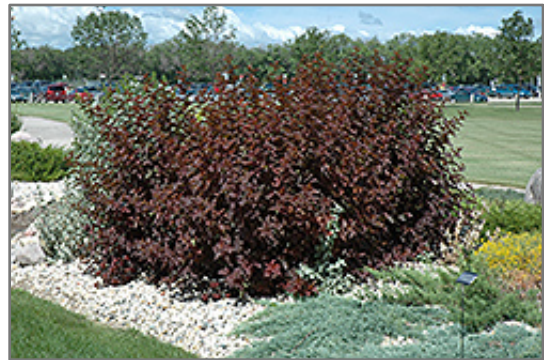
Diablo Ninebark