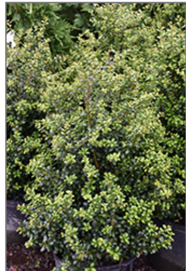
Chesapeake Japanese Holly