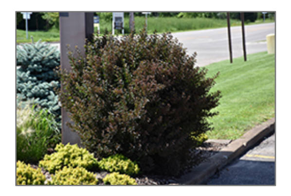
Little Devil Ninebark

Little Devil Ninebark is recommended for the following landscape applications;