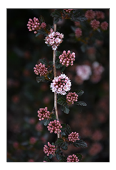
Little Devil Ninebark flowers

CustomerCare@WestonNurseries.com 93 East Main Street Hopkinton MA 02148 - (508) 435-3414 160 Pine Hill Road Chelmsford MA 01824 - (978) 349-0055 COMMERCIAL: commsales@westonnurseries.com - (508) 293-8028