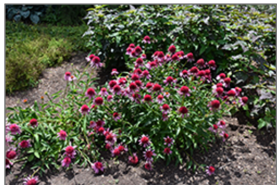
Double Scoop Bubble Gum Coneflower in bloom