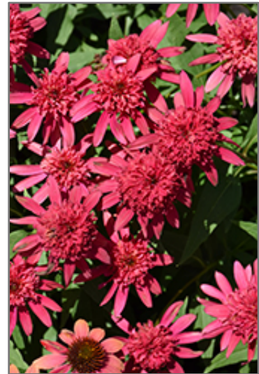
Double Scoop Raspberry Coneflower flowers