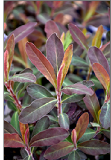
Purple Wood Spurge foliage

Purple Wood Spurge is a fine choice for the garden, but it is also a good selection for planting in outdoor pots and containers. It is often used as a 'filler' in the 'spiller-thriller-filler' container combination, providing a mass of flowers and foliage against which the thriller plants stand out. Note that when growing plants in outdoor containers and baskets, they may require more frequent waterings than they would in the yard or garden.