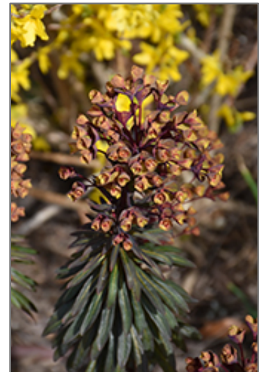
Purple Wood Spurge flower buds