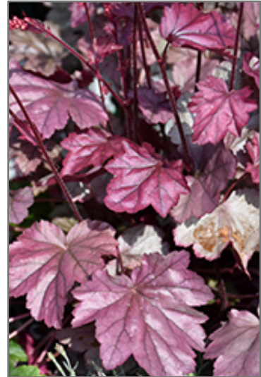
Stainless Steel Coral Bells foliage