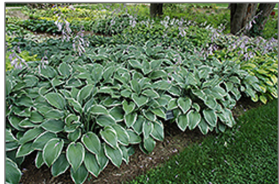
Winter Snow Hosta in bloom