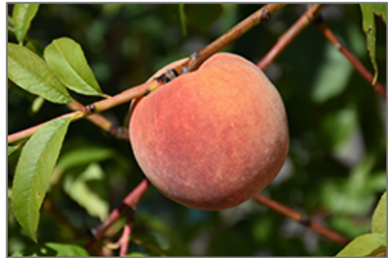
Redhaven Peach fruit

Redhaven Peach is covered in stunning clusters of fragrant pink flowers along the branches in early spring, which emerge from distinctive rose flower buds before the leaves. It has dark green deciduous foliage. The narrow leaves turn yellow in fall. The fruits are showy yellow drupes with a red blush, which are carried in abundance in mid summer. The fruit can be messy if allowed to drop on the lawn or walkways, and may require occasional clean-up.